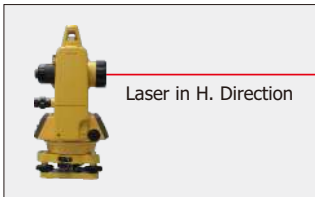
Laser in H. Direction