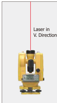
Laser in V. Direction